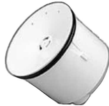
Cartridge only shown in picture.

Cartridge Kit Includes: Cartridge, Cartridge Key, Sealant Package, Protective Glove and Disposal Bag.